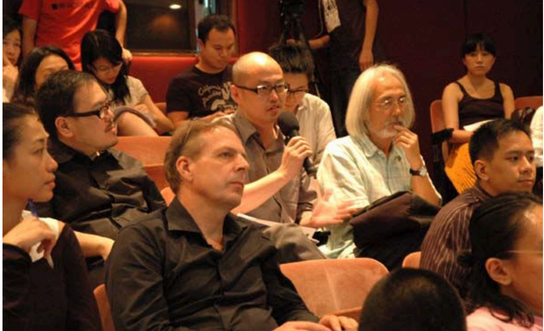
Open floor discussion.

with what actually happened in Hong Kong. There are indeed a lot of large issues—instability in Hong Kong during the 1950s, 60s, and 70s, lots of movement in the art scene, lots to do with politics and society. However, once we get into the 1980s, with the rise of the local economy and a sort of stabilization in society, it became what I called a “middle-class syndrome,” which is an uneventful, very stable, peaceful period, which has lasted all the way through to the present.